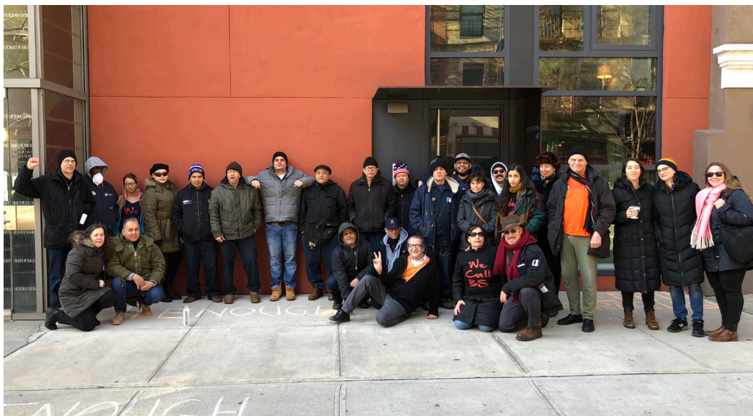
'March for Our Lives' walk out event in front of Downtown Art. with FABnyc members, allies, neighbors, and friends.

Coordinated an immigration and sanctuary learning event for a city coalition of cultural groups, presenting Art Sanctuary, New Sanctuary NYC, and ICE Free Queens