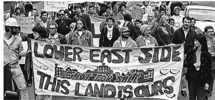
This Land is Ours, Marlis Momber