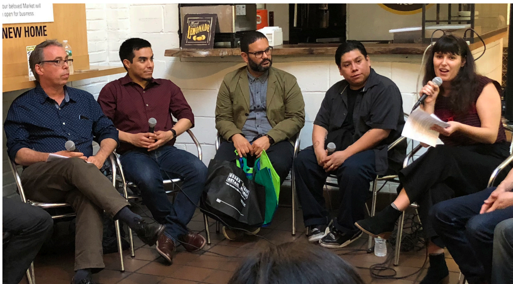
'In, Of, and Crossing Essex' with Artists Alliance / Essex Market on artists supporting small business retention; panel presentation.