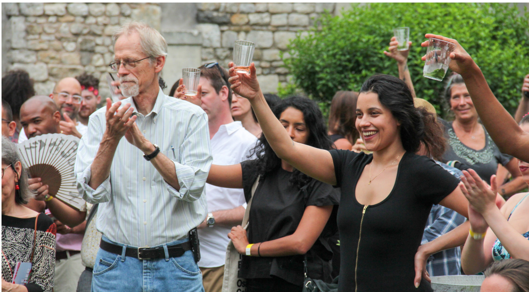
FABnyc members, allies, friends, and neighbors celebrate another year of FABnyc working in coalition in the Lower East Side at COME TOGETHER The 2018 Benefit party in the Marble Cemetery.